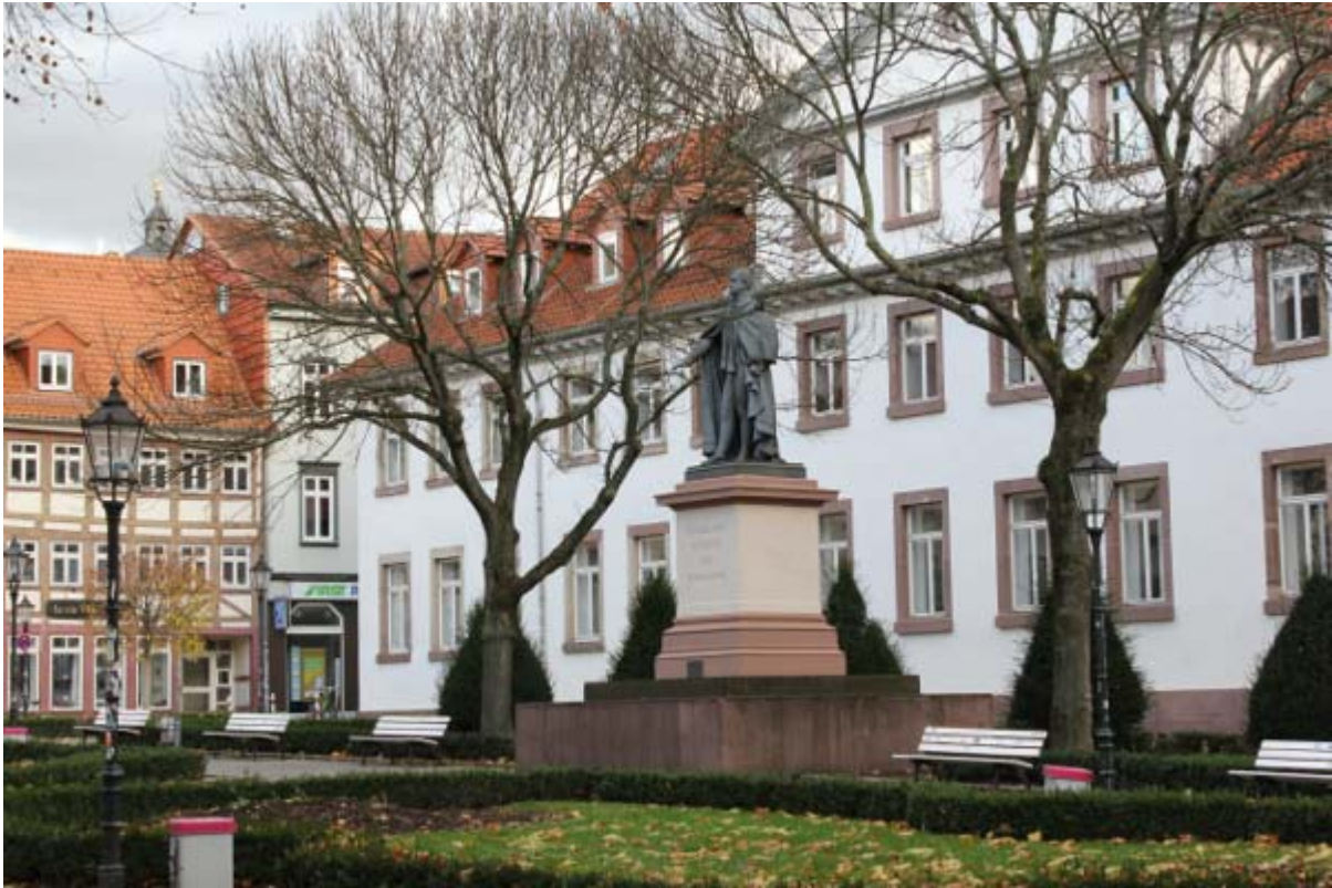
FIGURE 3 — WILHELMSPLATZ, THE OFFICAL CENTRE OF THE UNIVERSITY OF GÖTTINGEN.

undergraduate student. By the end of the month, I had my first salary instalment and I could nearly afford to be excited, except that I knew I had to pay off debts and start saving because I was contracted for only a couple of years. Putting all that aside, I focused on trying to learn German at night classes (a disaster and rather inefficient) and getting settled in the lab (much easier).