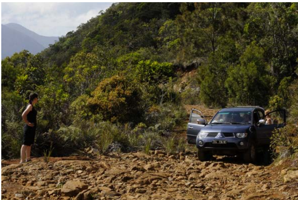
FIGURE 7 — FIELDWORK IN NEW CALEDONIA.

On the North Island in New Zealand, I collected fresh and sub-fossil resins from endemic resin-rich tree species so that I could start to understand fossilization processes in resins. I also collected amber from lignite mines in the South Island. It was a messy, sticky, but amazing time, and I am incredibly lucky to have been able to go and do this as part of my job. A postdoc is not, however, just about fun in the field, and after the fieldwork the ‘real’ work of chemical analyses must begin; so, back to the lab in Germany.