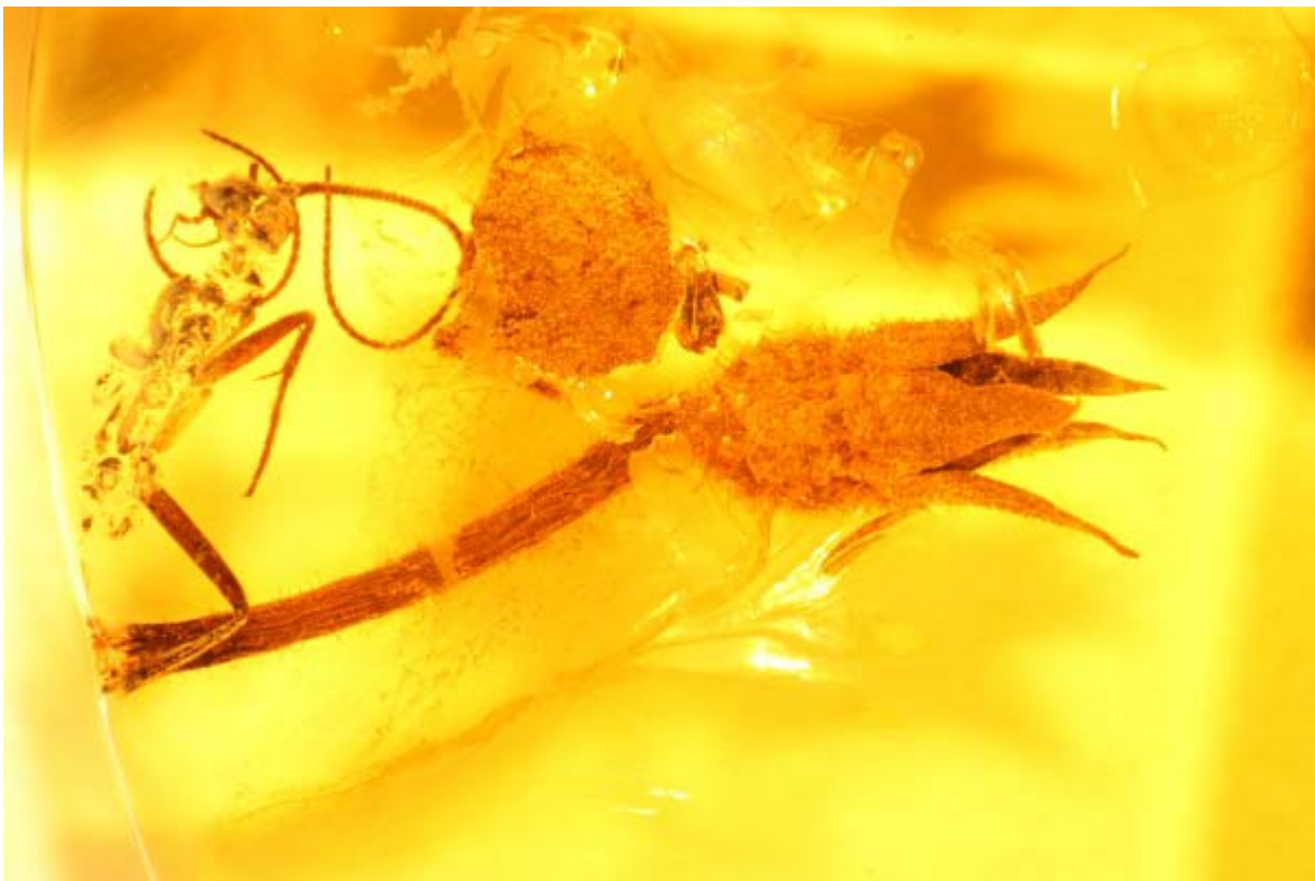
FIGURE 5 — FOSSILS PRESERVED IN AMBER.

I could not possibly hope to answer all of these questions in a short field season or even in one three-year postdoc position, but I wanted to at least work out how I could go about answering the questions in the future. The research team that I joined also wanted to learn about newly discovered New Zealand amber deposits, and I was particularly keen to study the fossil plants surrounding them. All this would help us to figure out how these fossils are related to the resin-rich trees that still inhabit the Southern Hemisphere. This subject closely integrates both living and fossilized seed plants, and is strongly linked with their evolutionary history. It is the sort of work that I have always wanted to do.