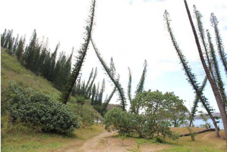
FIGURE 6 — FIELDWORK IN NEW CALEDONIA.

of the plants are extremely endangered, so it was vitally important that I get legal permissions to observe, record and collect them.