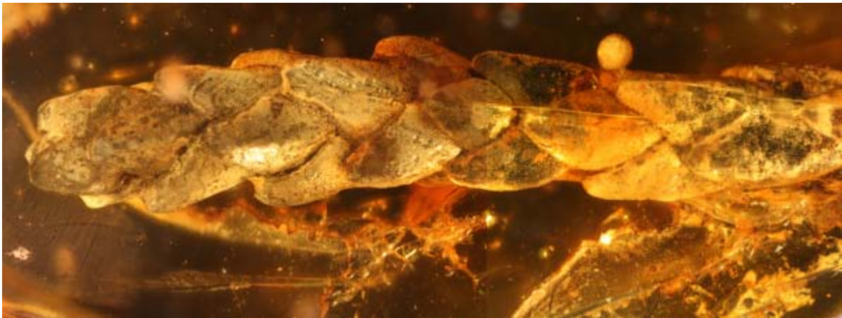
FIGURE 2 — CYPRESS TWIG PRESERVED IN AMBER.

I thought long and hard when deciding on my PhD subject; I knew I would have to devote several intense years to working on living and fossil plants, and this would dictate what I could do next and how I would be able to work in the future. As a result, I really enjoyed most of the experience, although it was not always what I was expecting. During the last two years of my PhD I had to begin thinking about what to do and where to go next, because proposals for research funding can take many months or even years to devise, write up and get assessed. I started developing projects to follow on from my PhD work, and I also started getting involved in other people's applications for funding. I was very optimistic! I breathed a huge sigh of relief when I passed the defence of my PhD at the end of 2008, and thought: OK, everything is going well on the application front, but I wonder how this disaster in the world economy is going to unfold? Well, indirectly it was to have a massive impact on my future.