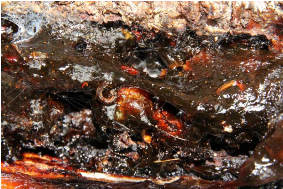
FIGURE 4 — MILLIPEDES TRAPPED IN FRESH RESIN.

Fieldwork allowed me to develop ideas and collect material with which I could start to answer questions about the relationship between resin (the ‘sticky stuff’ in some living seed plants) and amber, which is fossilized resin.